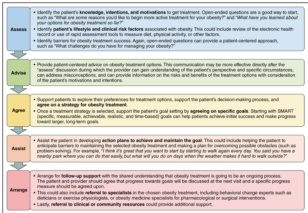
Figure 2. The 5A (assess, advise, agree, assist, and arrange) model for implementing obesity treatment in primary care.

training needs and defining competencies. 21 The round-table's work is a valuable resource in filling important gaps in knowledge and skills among health care professionals.